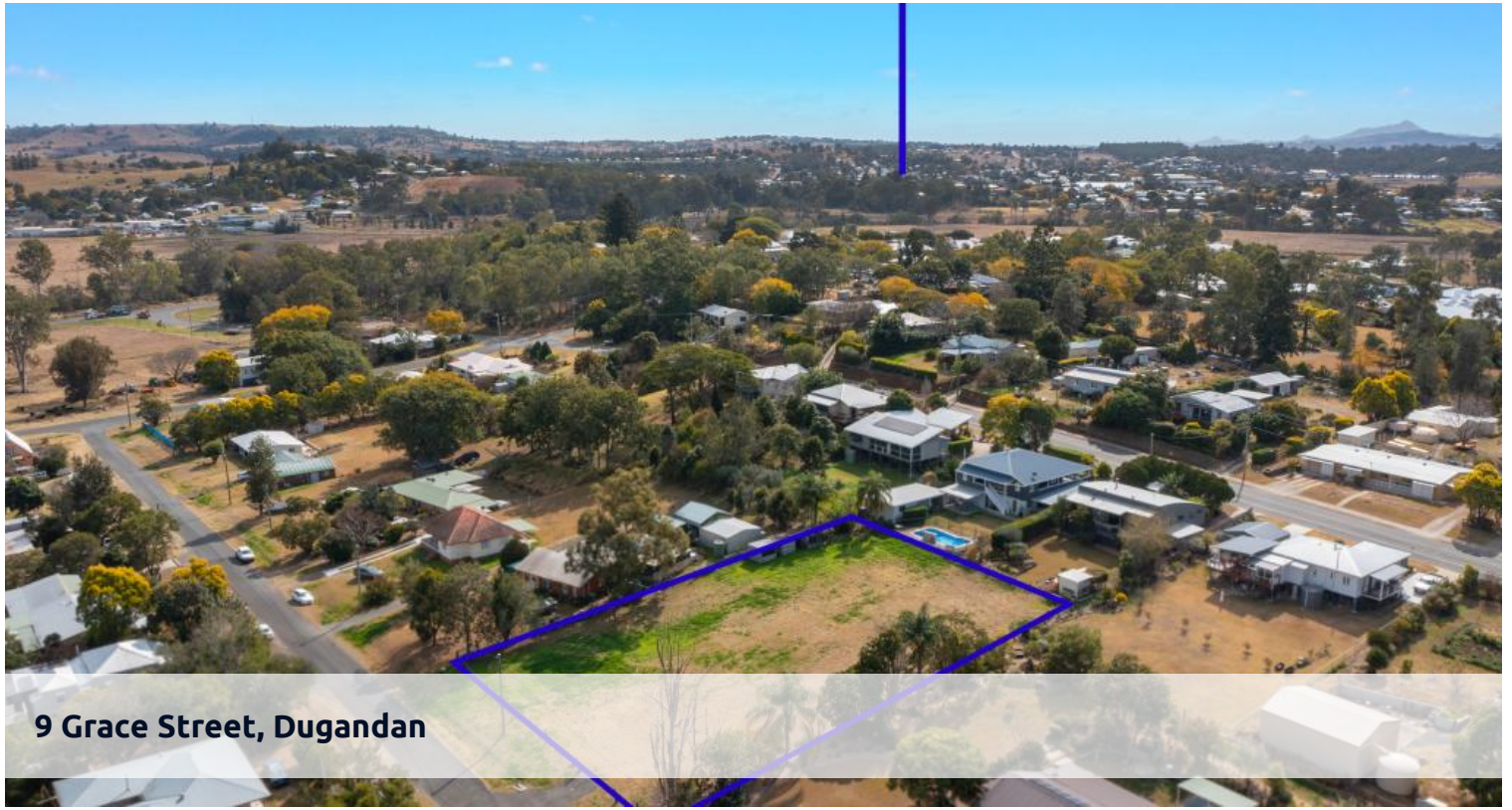
9 Grace Street, Dugandan